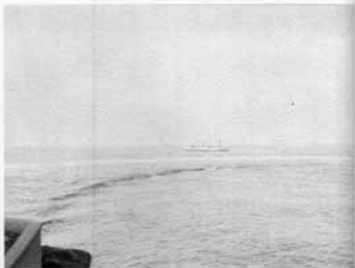
ALL AHEAD FLANK DESTINATION SAN DIEGO