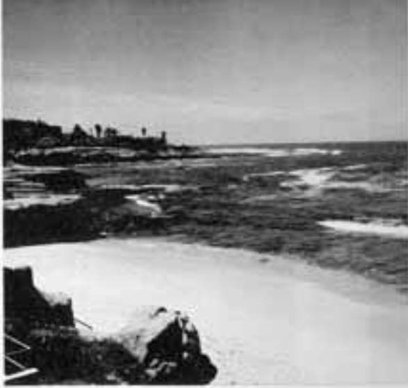
LA JOLLA BEACH

AFTER A DAY OF AMMUNITION LOADING AT BANGOR THE KING SET SAIL FOR SAN DIEGO.