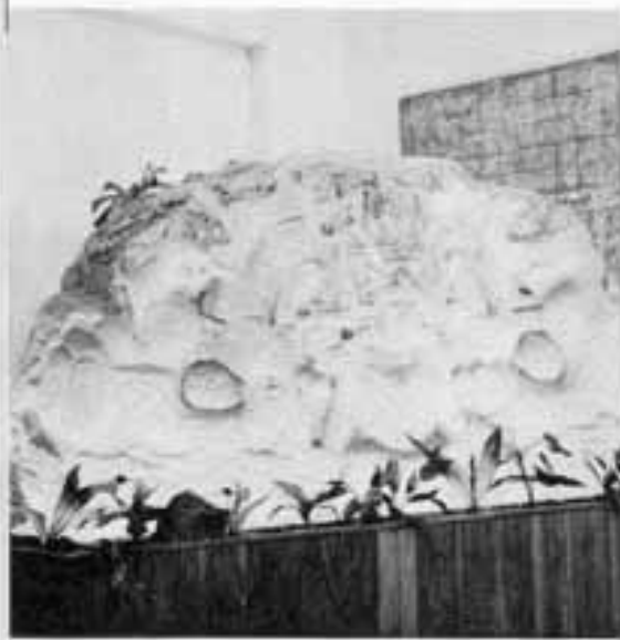
MUSEUM OF MAN