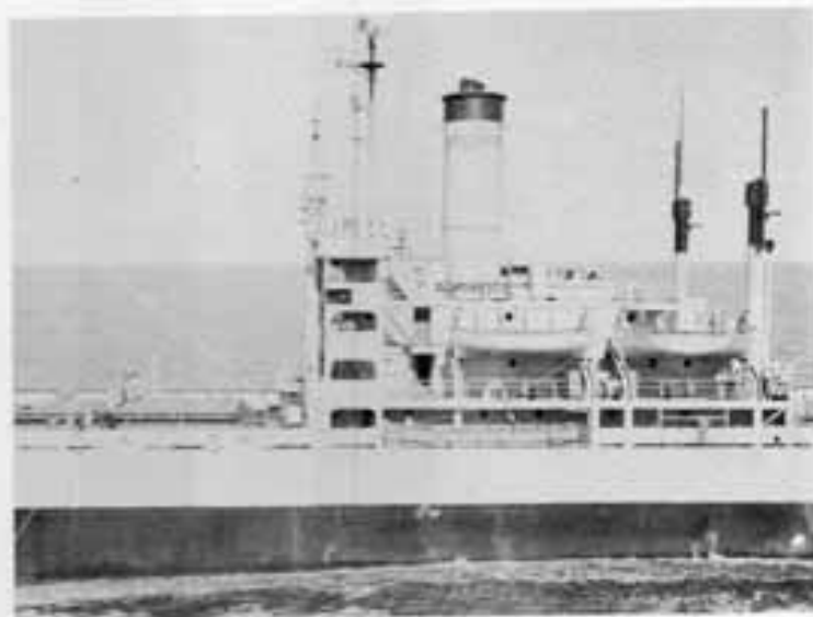
ALONG SIDE RICHFIELD