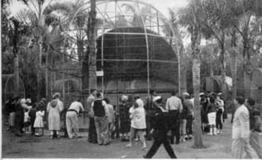
SAN DIEGO ZOO