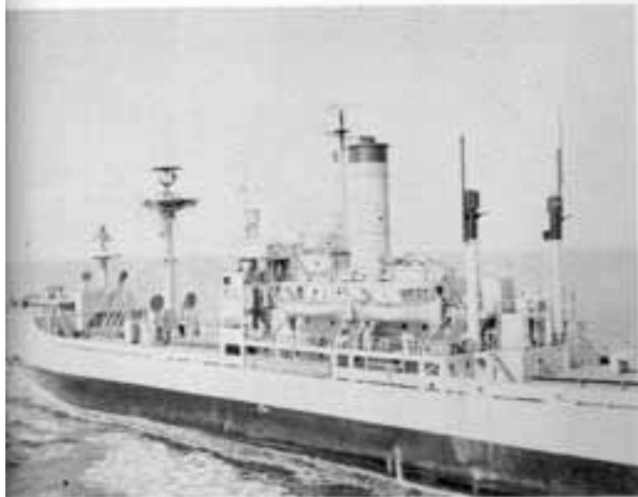
APPROCHING USNS RICHFIELD