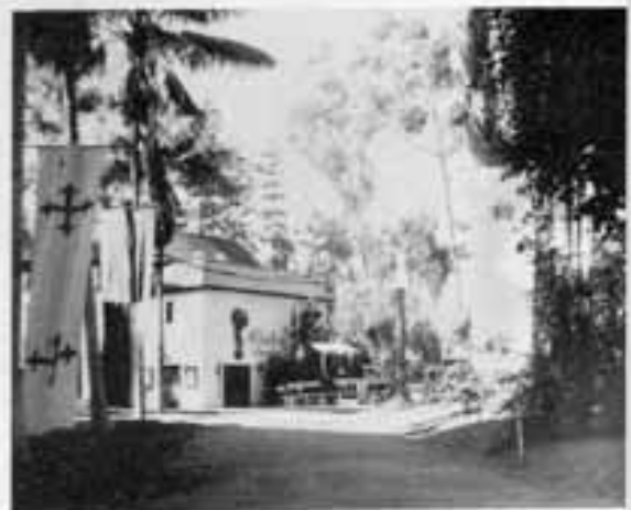
OLD GLOBE THEATER