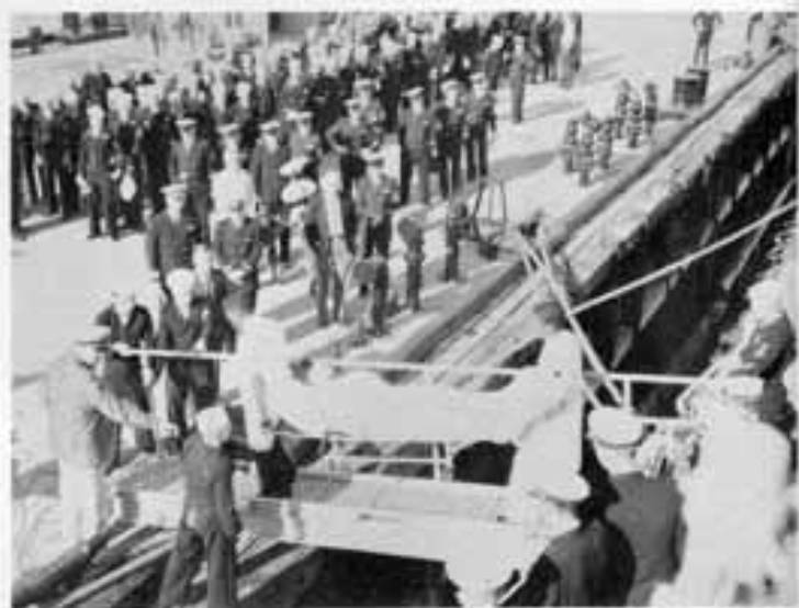
SICKMAN BEING TRANSFERRED FROM KING TO AMBULANCE