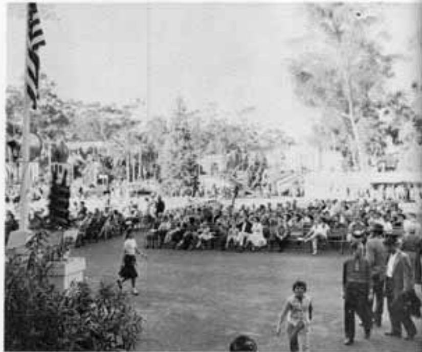
CONCERT AT BALBOA PARK