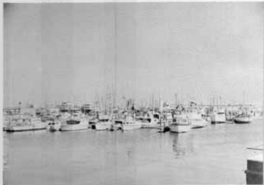
BOAT FLEET AT FISHERMAN'S WHARF