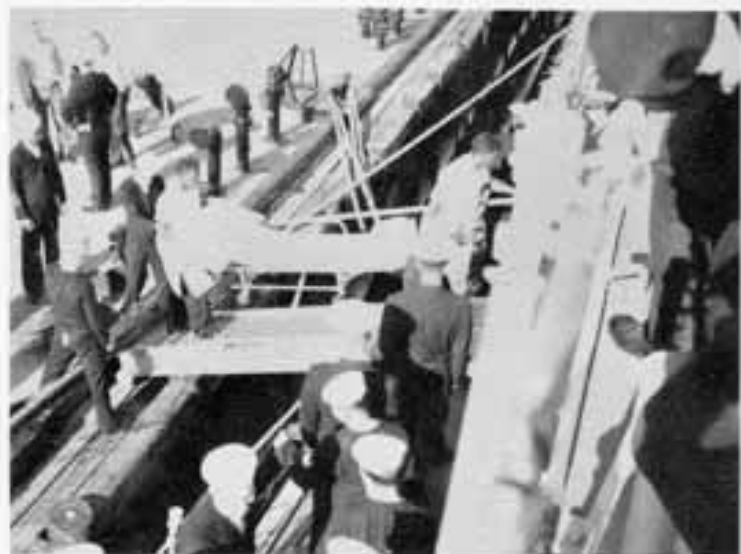
NAVY CORPSMAN COME ABOARD