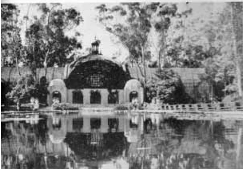
LILLY POOL AT BALBOA PARK