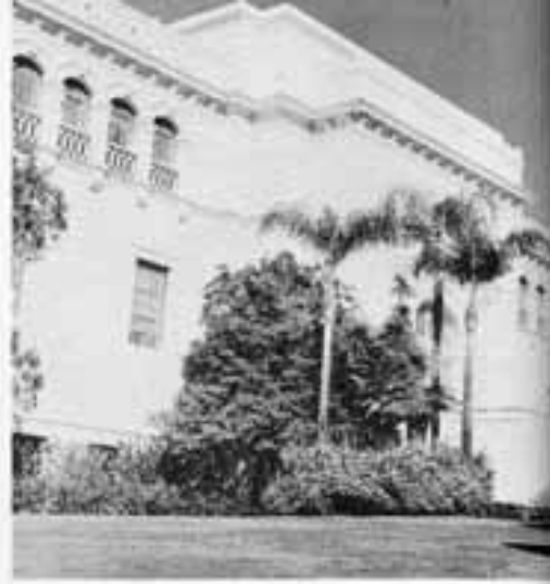
MUSEUM OF NATURAL HISTORY