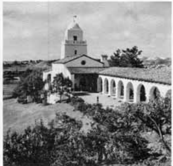
PRESIDIO PARK MUSEUM