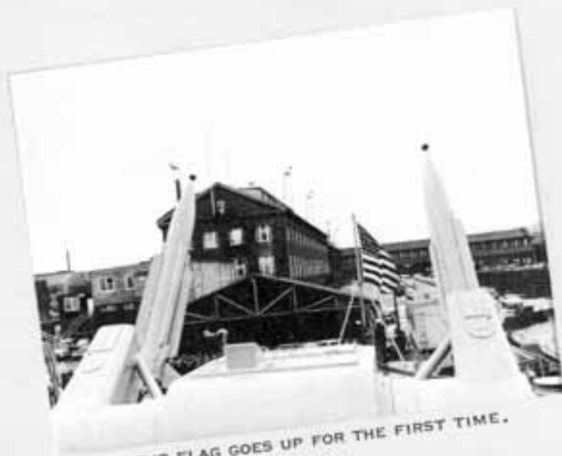
THE FLAG GOES UP FOR THE FIRST TIME.