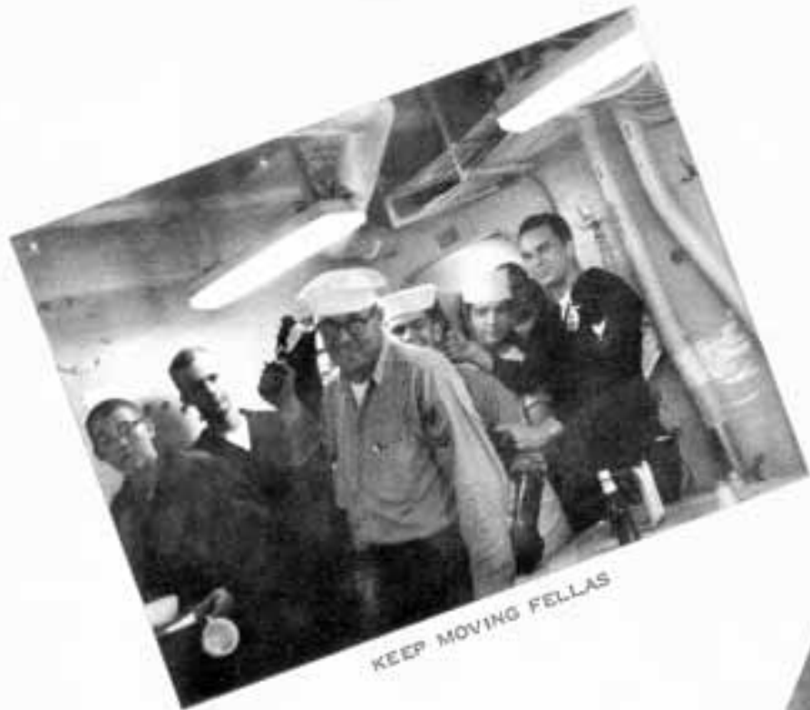
KEEP MOVING FELLAS