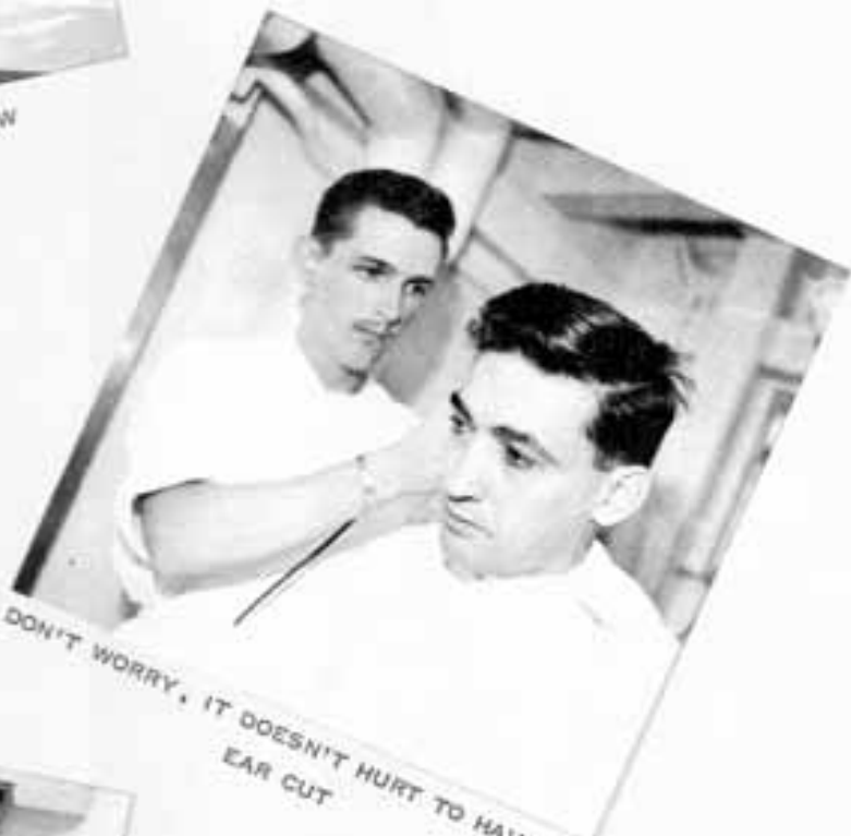
DON'T WORRY. IT DOESN'T HURT TO HAVE AN EAR CUT