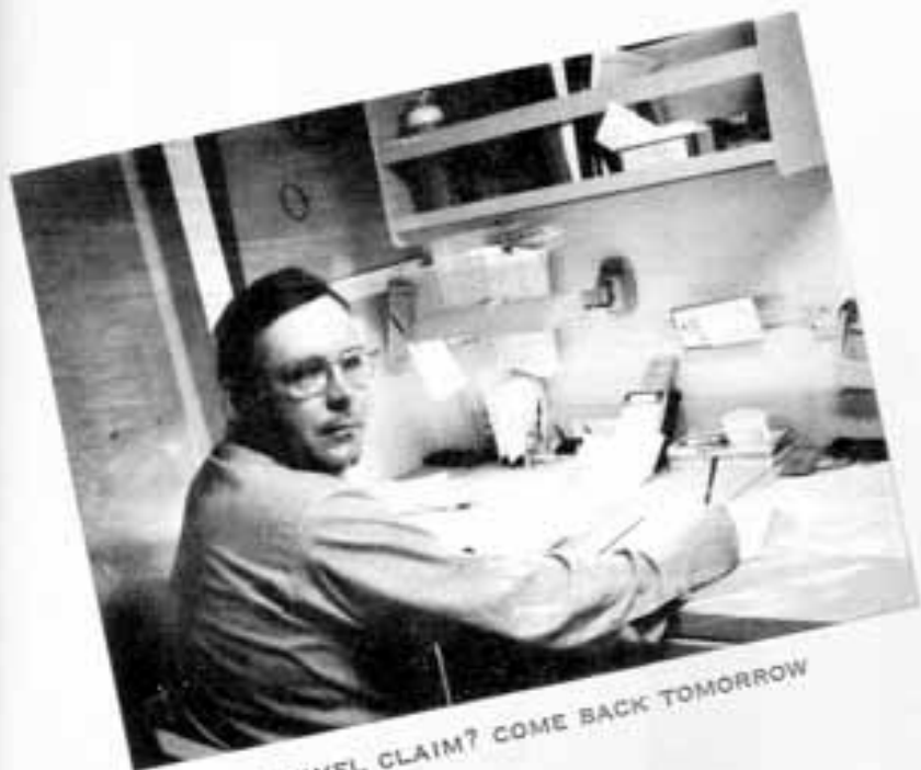
TRAVEL CLAIM? COME BACK TOMORROW