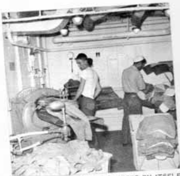
WOW!! THAT MACHINE PRESSES BY ITSELF