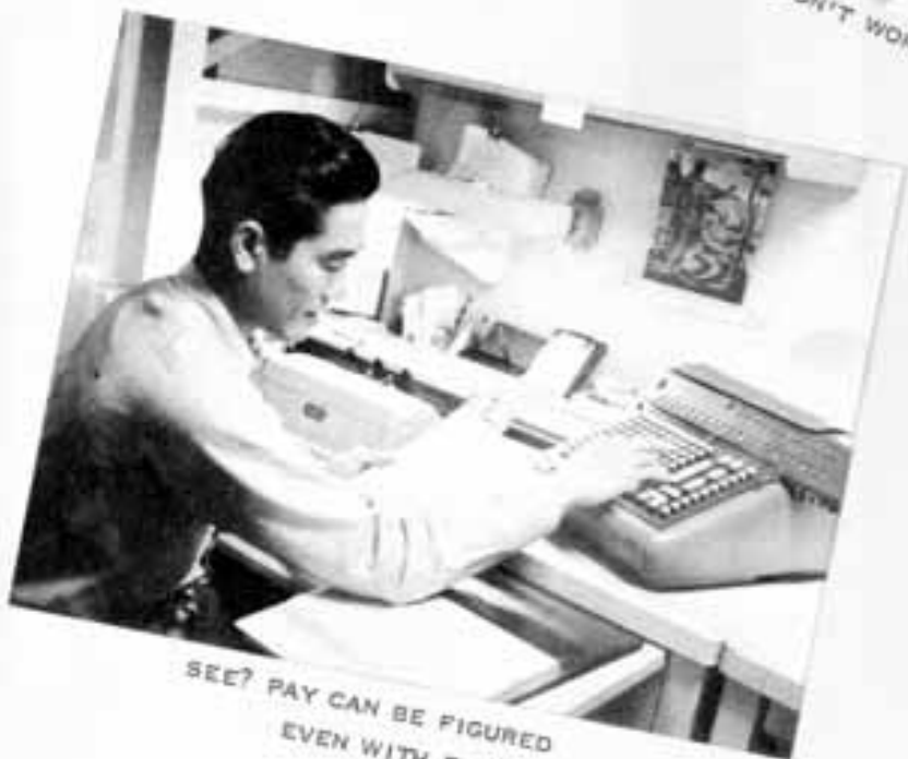
SEE? PAY CAN BE FIGURED EVEN WITH EYES CLOSED