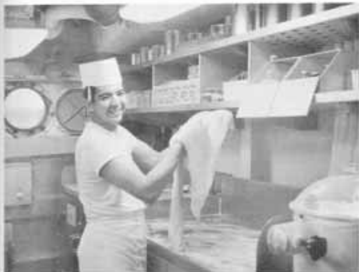
YOU EAT IT, I DON'T