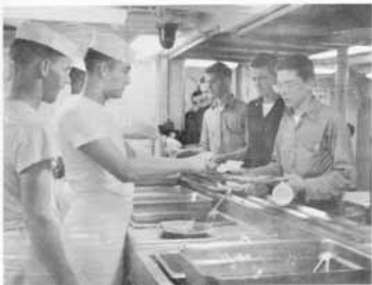
SOME MORE PLEASE