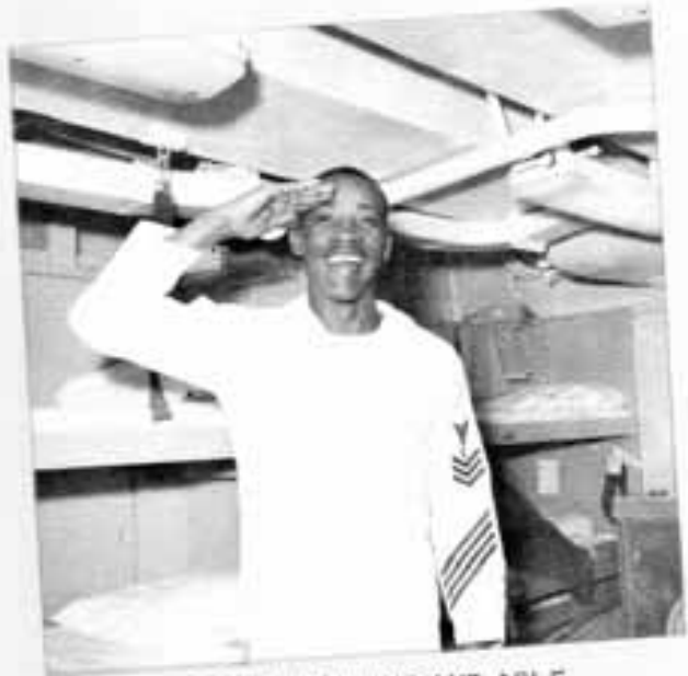
READY, WILLING AND ABLE