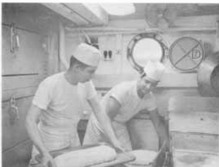
LET'S SAVE THESE FOR US