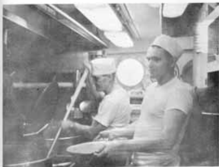
BEANS, OUR SPECIALTY