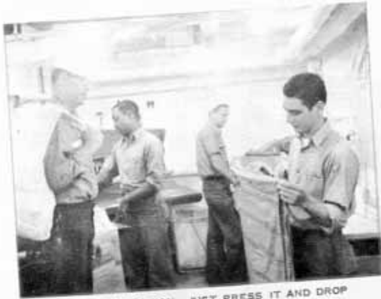
IT'S STILL CLEAN, JUST PRESS IT AND DROP IT IN THE BAG