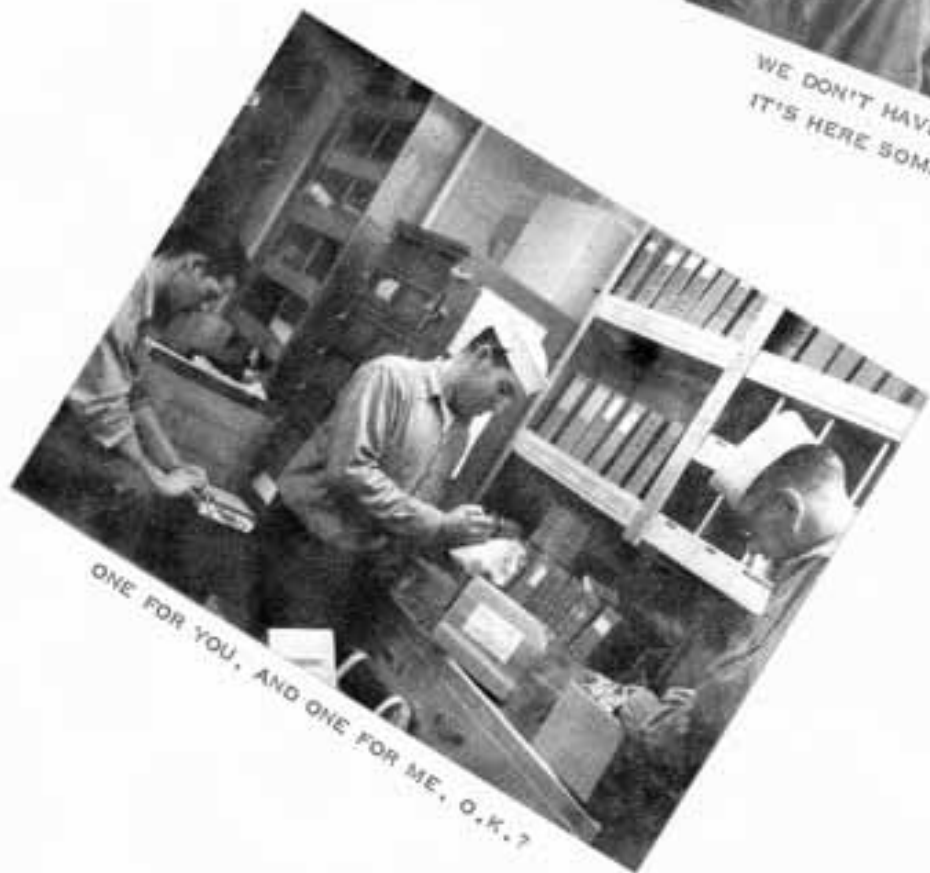
ONE FOR YOU, AND ONE FOR ME, O.K.?