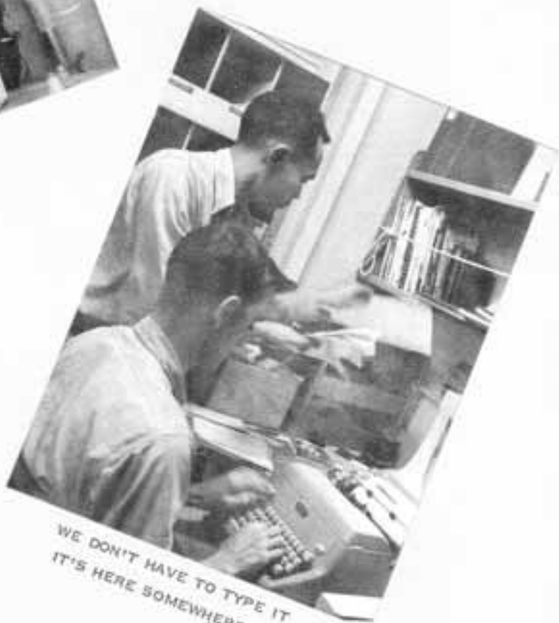
WE DON'T HAVE TO TYPE IT IT'S HERE SOMEWHERE