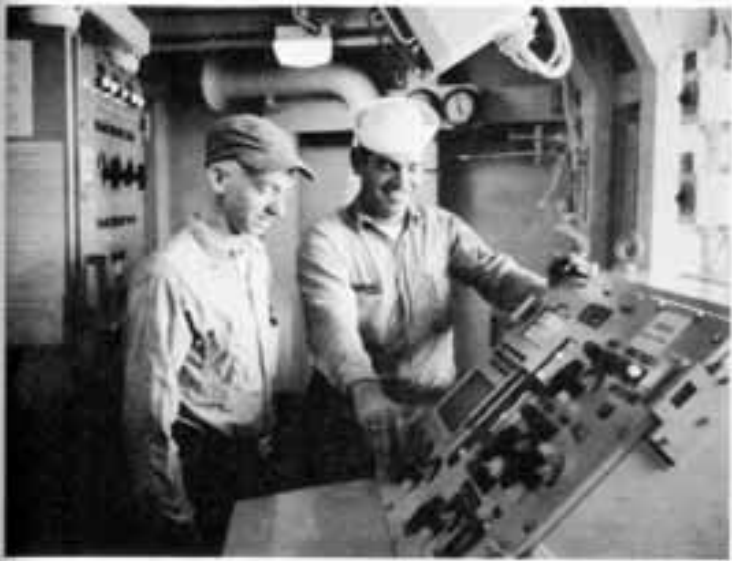
SO YOU PUT A NICKEL IN AND NOTHING CAME OUT, EH?