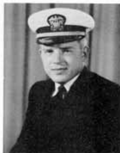
ENS SESTRIC ASST. FIRST LIEUTENANT