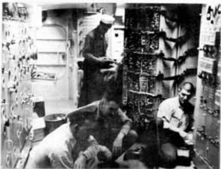
NOW CHECK THE 1,000,000,000 VOLT SUPPLY SON