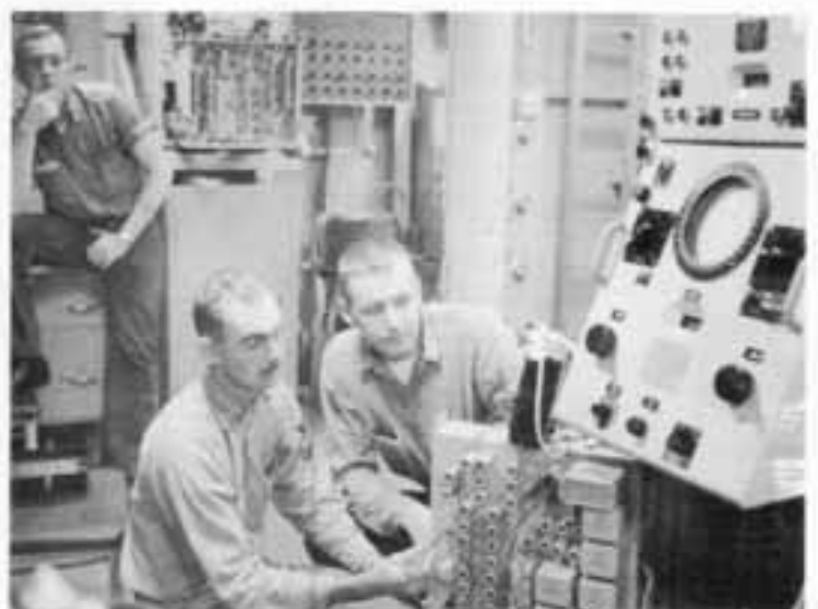
SEE PATE, I TOLD YOU SO!