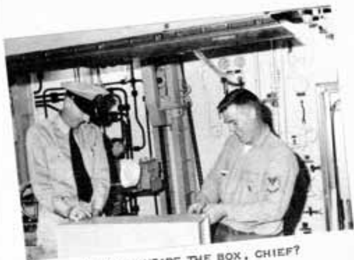
WHAT'S INSIDE THE BOX, CHIEF?