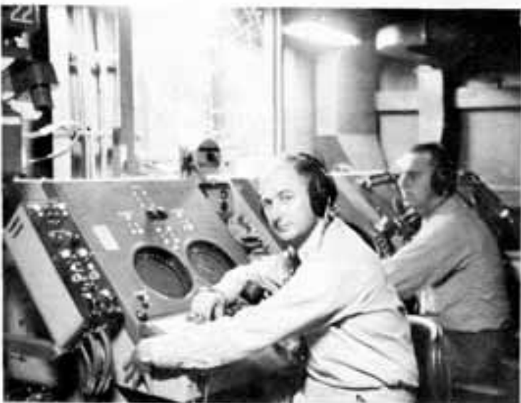
"WAC AND DAC"