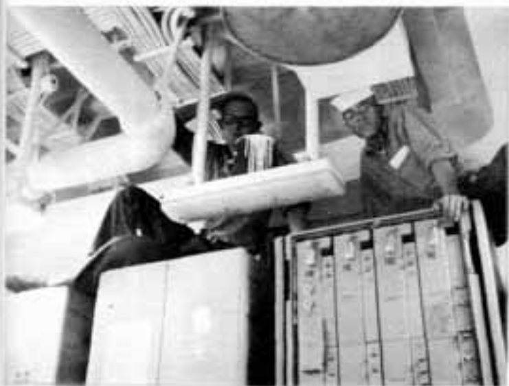
IT DIDN'T MOVE SO I PAINTED IT, SIR