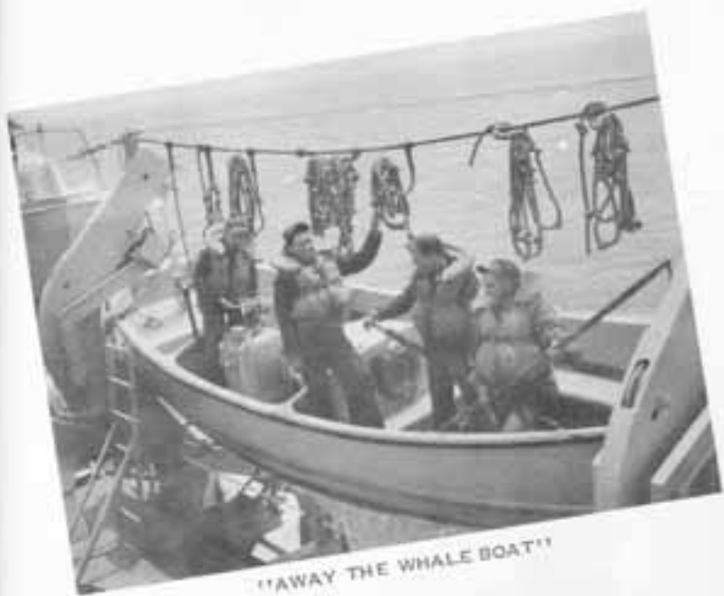
"AWAY THE WHALE BOAT"