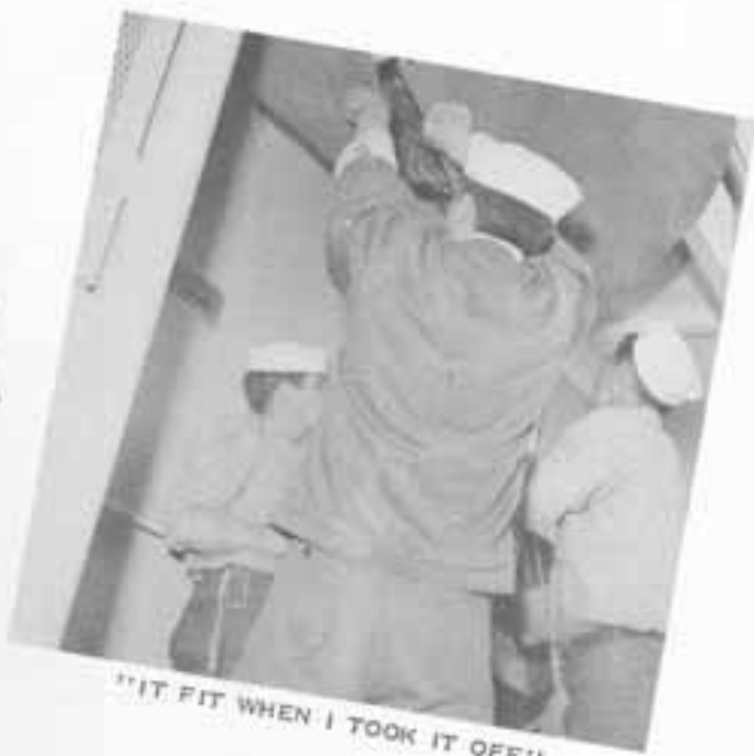
"IT FIT WHEN I TOOK IT OFF"