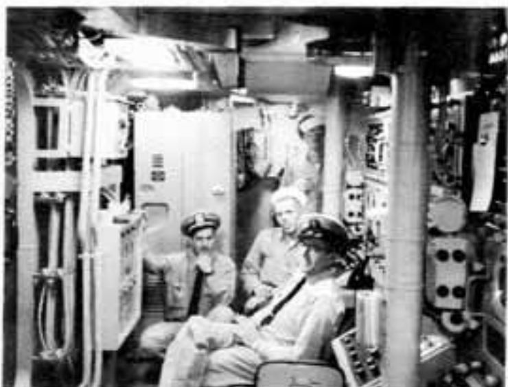
DID YOU SAY LIBERTY CALL?