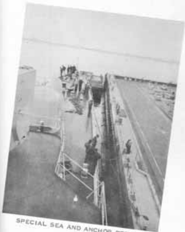
SPECIAL SEA AND ANCHOR DETAIL