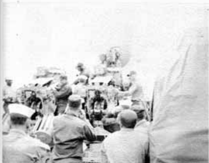
FASTER YOU FOOLS!