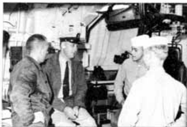
"I DON'T CARE WHAT THE OP SAYS FARMER, IT WORKS LIKE THIS!"