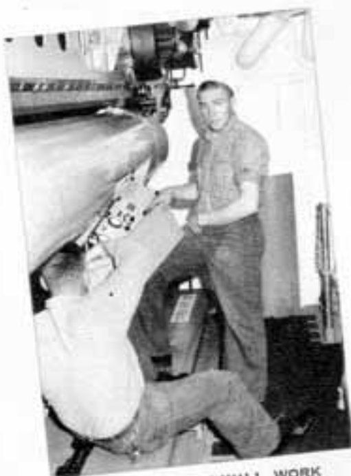
OF COURSE IT WILL WORK