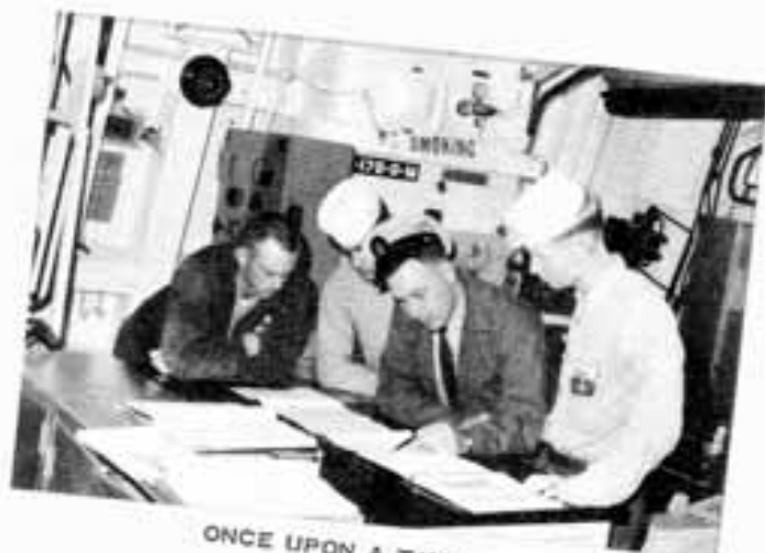
ONCE UPON A TIME...