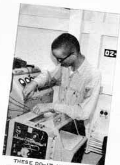
THESE DO-IT-YOURSELF KITS GET MORE COMPLICATED ALL THE TIME