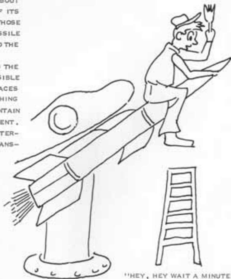
"HEY, HEY WAIT A MINUTE!"

THIS JOB IS DONE BY THE MISSILE GUNNERS AND THE GUIDED MISSILEMEN. THE GUNNERS MATES ARE RESPONSIBLE FOR THE MAINTENANCE OF THE MISSILE MAGAZINE SPACES AND THE OPERATION AND REPAIR OF THE MISSILE LAUNCHING SYSTEM. THE GUIDED MISSILEMEN PRIMARILY MAINTAIN THE MISSILES AND OPERATE THE MISSILE TEST EQUIPMENT. THE GUIDED MISSILEMEN ALSO MAN THE SHIP'S TELEMETERING STATION, WHICH RECORDS MISSILE FLIGHT DATA TRANSMITTED FROM THE MISSILE.