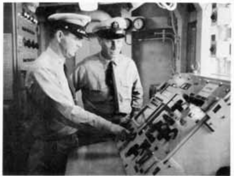
GENIUS AT WORK