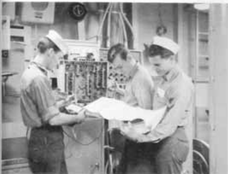
IF THIS DOESN'T WORK LET'S GET A BIGGER HAMMER