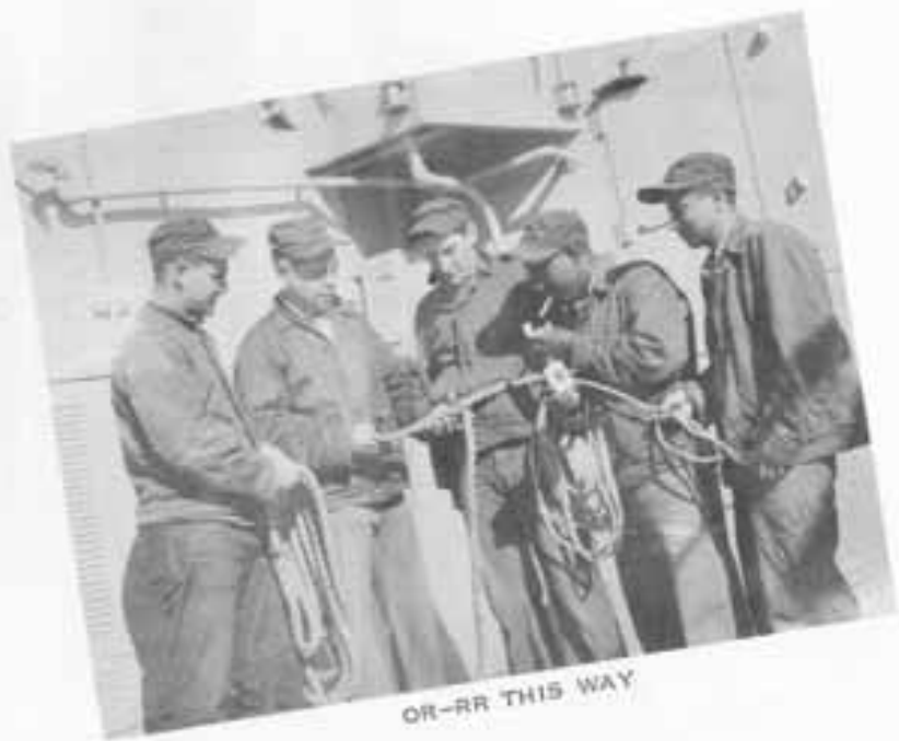
OR-RR THIS WAY