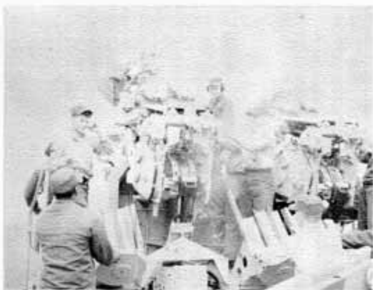
GENTLY NIX, GENTLY